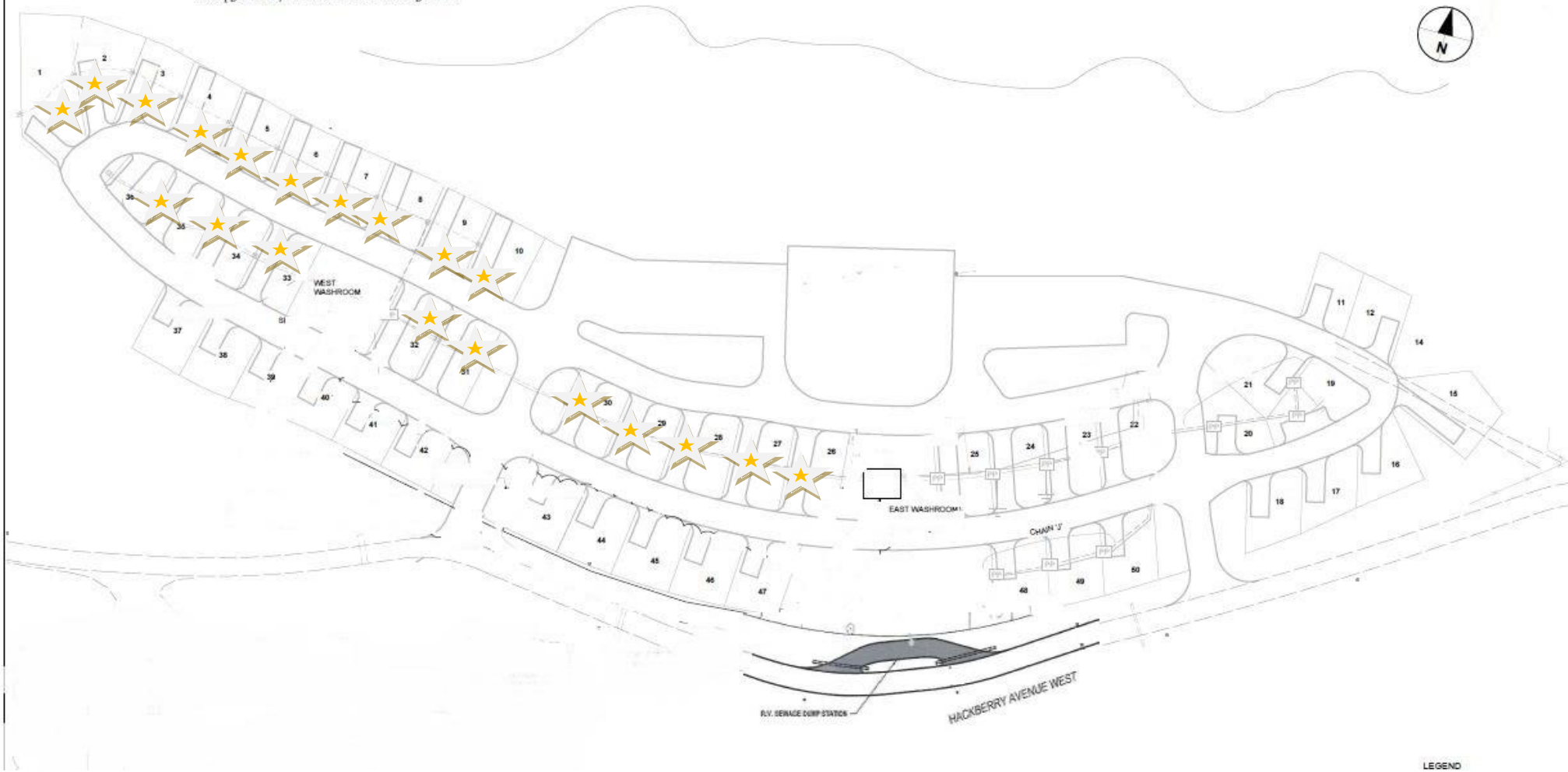
Campground layout - illustration of lot assignments